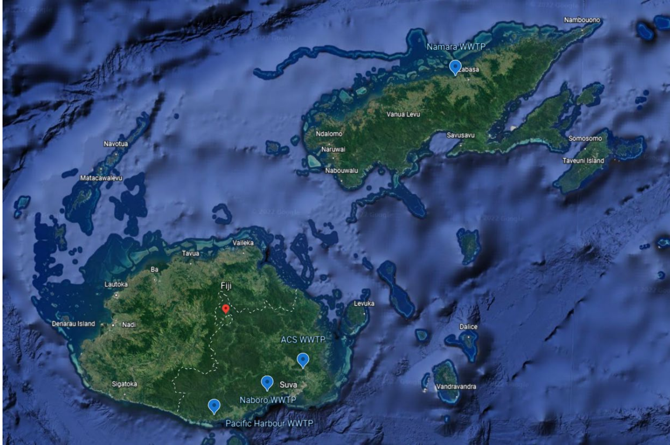
Figure 2: Location of the various WWTPs investigated throughout this study