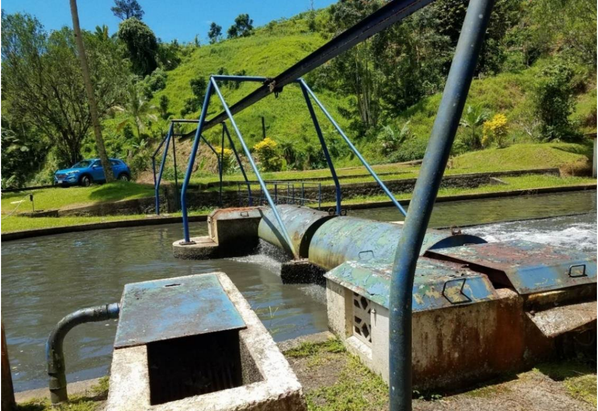
Figure 4: Oxidation ditch with surface aeration at Naboro WWTP