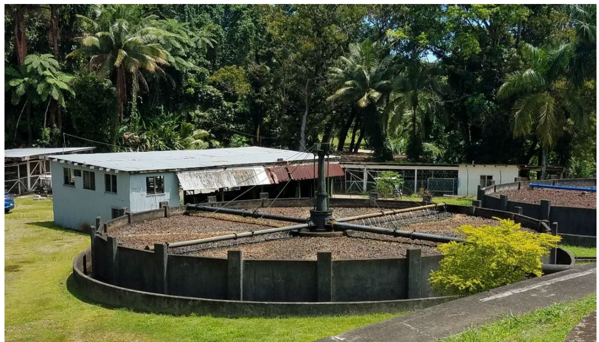
Figure 3: Trickling Filter and office building at Pacific Harbour WWTP